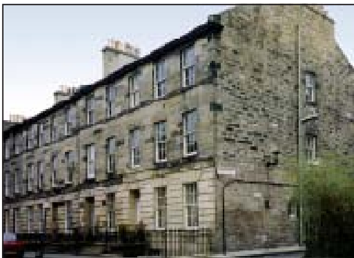
33 Cumberland Street -Edinburgh, as it is today.