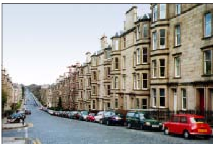
Comely Bank Avenue - Edinburgh (as it looks today) No.81 is located beside the red Mini.