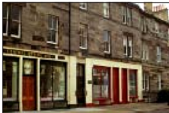
9 Cumberland Street - Edinburgh